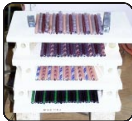
2- A select grouping of properly sized cane are laid up waiting their turn in the pick up kiln.