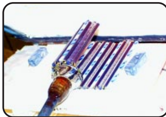
6- The clear collar on the end of the blow pipe is rolled over the ends of the tack fused cane so that they roll up like a blanket into a cylinder.