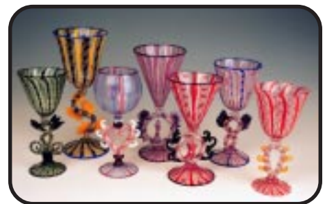
Zanfirico cane goblets

For information on art glass from Gossamer Glass studios, visit us on the web at: www.gossamerglass.com Other tip sheets include #1 Zanfirico Cane, #2 Cane roll-up, #3 Murrini Cane & lay-up, #4 Making a cane goblet. More sheets to follow.