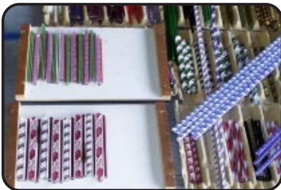
1- Complex zanfirico cane and other filigrana cane are made in the studio prior to laying out the design.