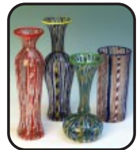
Zanfirico cane vases

12- This starter bubble can now be blown out into many different shapes. Goblet parts, vases or bowls