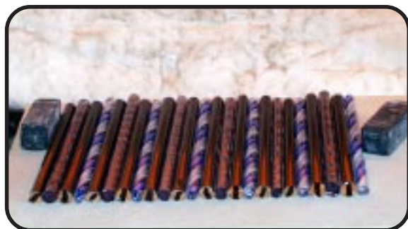
5- When the canes are hot enough to tack fuse they are ready for the roll up.