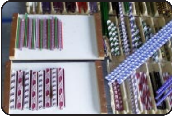
1- Complex zanfirico cane and other filigrana cane are made in the studio prior to laying out the design.