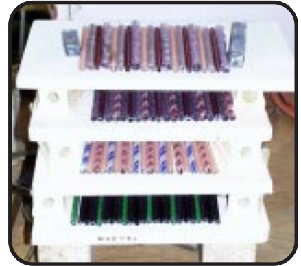
2- A select grouping of properly sized cane are laid up waiting their turn in the pick up kiln.