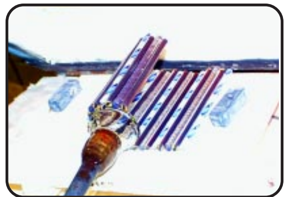
6- The clear collar on the end of the blow pipe is rolled over the ends of the tack fused cane so that they roll up like a blanket into a cylinder.